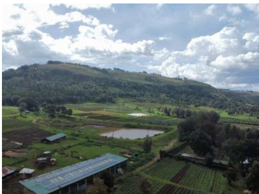
← Rooftop solar installations, invisible from land

The plant is currently meeting its performance target when compared to its simulated value.