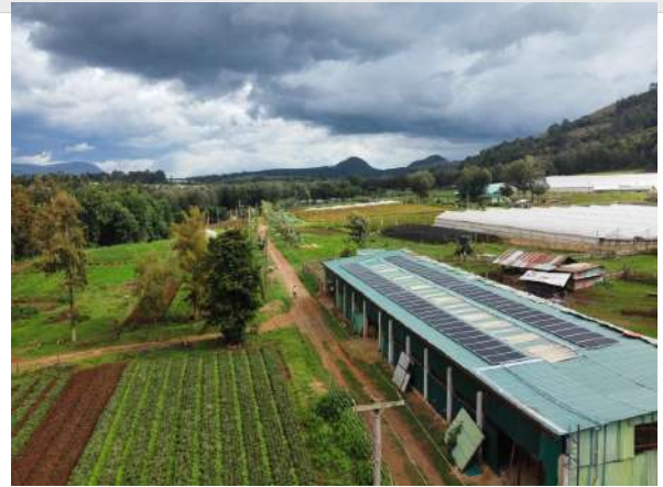
↑ 34.88 kWp Rooftop Installation

The 142.79 kWp system consists of 262 x JA Solar 545 Wp panels which convert sun radiation into electrical energy, as well as 4 x Huawei Sun2000-30KTL, 30 kW inverters. The system is expected to save Wilfay Flowers an estimated $244,719 in its 20-year lifespan.