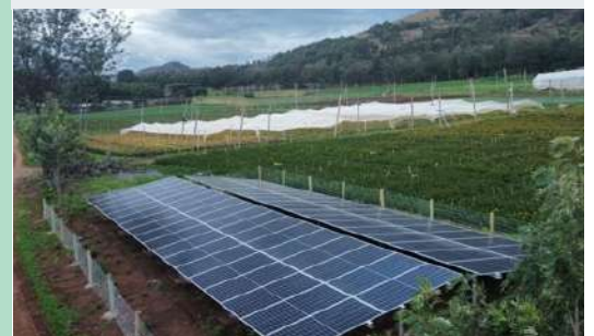
↑ 39.24 kWp Ground mounted section

In this way, the system is split and the power generated is allocated to various transformers to accommodate their network tap in requirements.